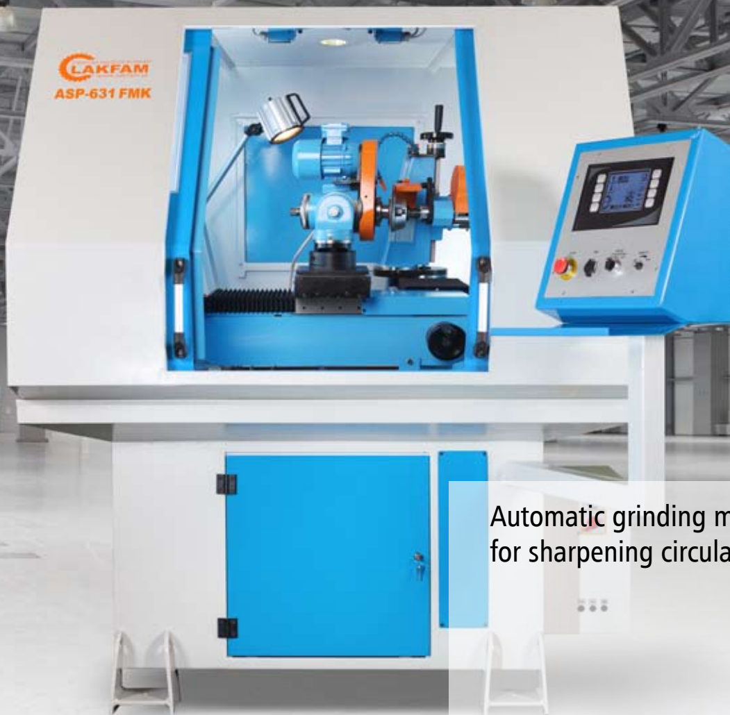
Automatic grinding machine for sharpening circular knives